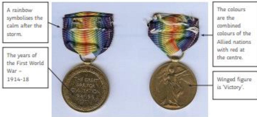
Bronze medal, not too expensive after the war, but long lasting.

This medal celebrated the end of the First World War and was given to soldiers who had fought in active theatres of the war. It was a symbol of great pride but its design was also highly symbolic .