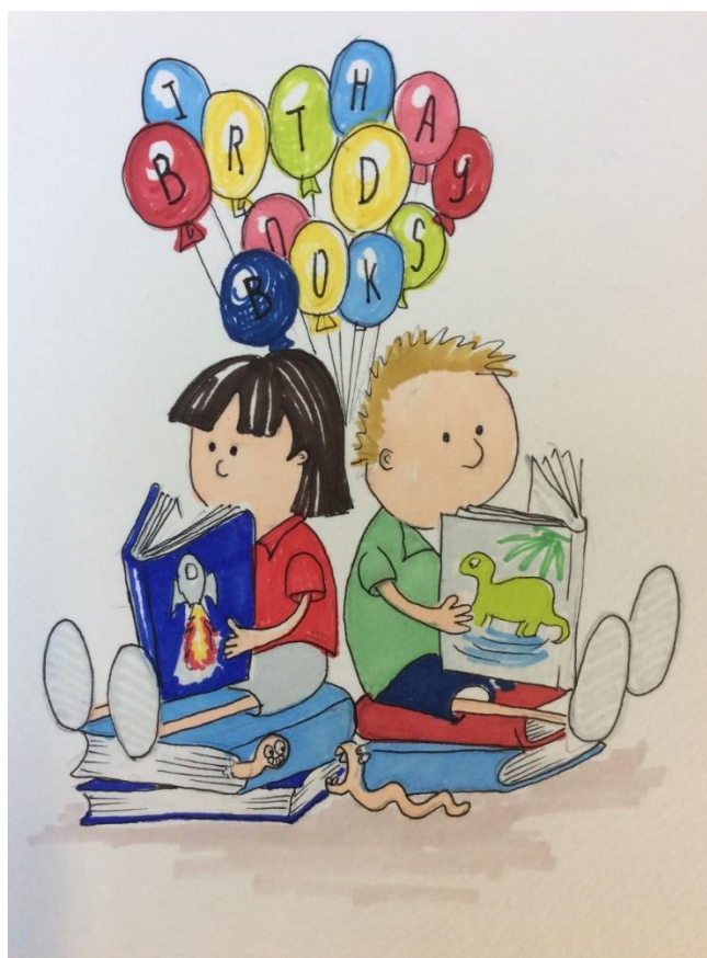
Illustration: Lyndsey Lewis

We are always wondering how to ensure a steady supply of lovely new books for our classroom book shelves – books that the children have recommended to each other and latest books by authors the children love.